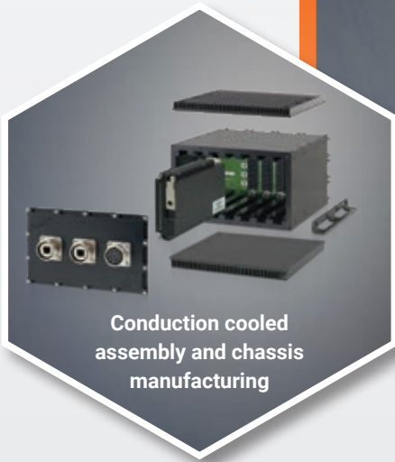
Conduction cooled assembly and chassis manufacturing