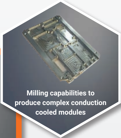
Milling capabilities to produce complex conduction cooled modules