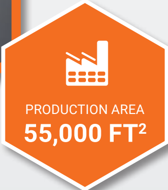
PRODUCTION AREA 55,000 FT 2