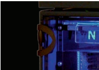
Door has 180° opening angle from the new hinge concept. Can be mounted on the left or right side