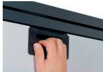
Simple fitting of side panel without tools