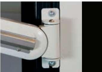
Heavy-duty rack with lateral groove for mounting support arm systems and other accessories