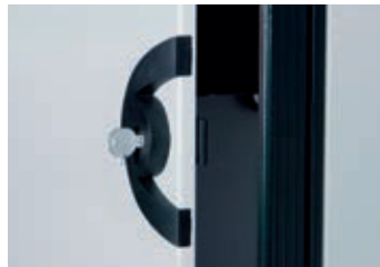
Robust locking handle