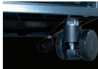
Extensive selection of castors