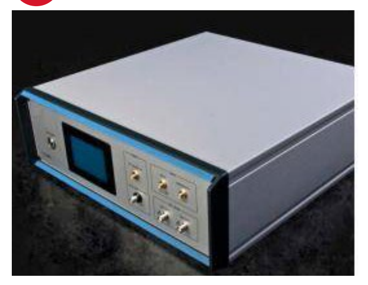
High-end timing application based on Propac PRO.