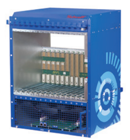
Image1: SCHROFF ATCA ECO Modular chassis from nVent

Table 1: Measurement results of ATCA ECO Modular