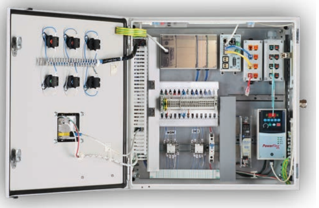
nVent HOFFMAN and SCHROFF Signaling Enclosures