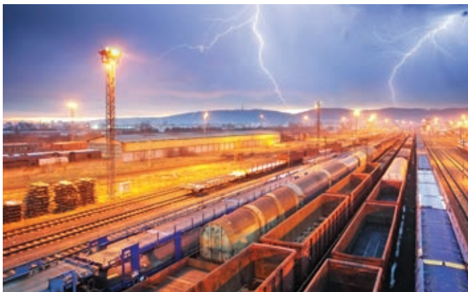
nVent ERICO Lightning Surge Protection

nVent also provides numerous solutions for winter safety, comfort and performance for railways operating in extreme cold conditions. Icy tracks are no match for our contact rail and switch heating systems, featuring innovative technology from the nVent ERICO and RAYCHEM products. nVent thermal solutions go beyond the track to include railway structures, such as rider platform heating, as well as onboard rail vehicles, with solutions for threshold (door way) heating. In addition to heating systems, nVent thermal solutions include fire rated wiring for applications in railway stations and tunnels.