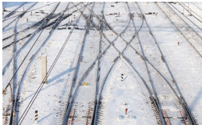
nVent ERICO and RAYCHEM Switch Heating Systems