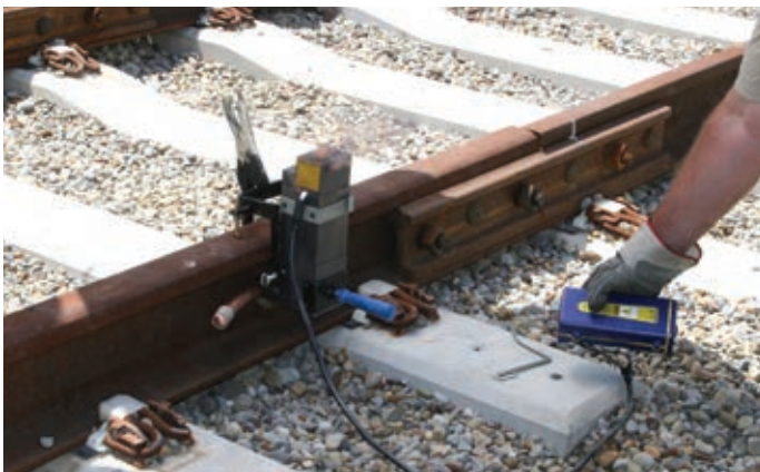
nVent ERICO Cadweld

nVent HOFFMAN products include wall mounted and freestanding enclosures for outdoor, trackside, applications as well as indoor enclosures for applications on-board rail vehicles and network buildings. nVent SCHROFF products include innovative indoor and outdoor cabinets, racks and subracks for trackside, rolling stock and network structure applications. These enclosure solutions seamlessly integrate and protect the components critical to safe and reliable railways.